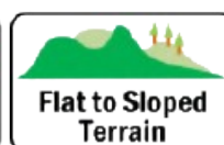
Flat to Sloped Terrain