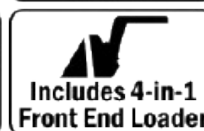
Includes 4-in-1 Front End Loader