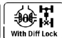
With Diff Lock